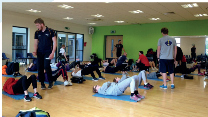
Regional Para-Swimming Training Programme