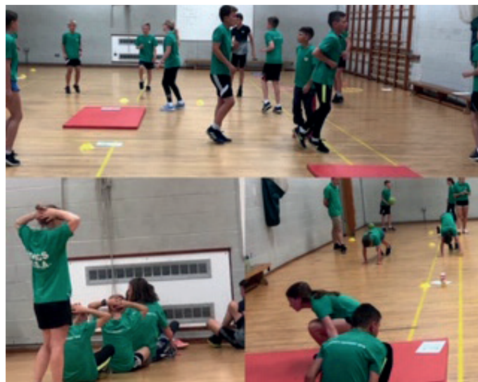
Lincolnshire County Pathway Programme