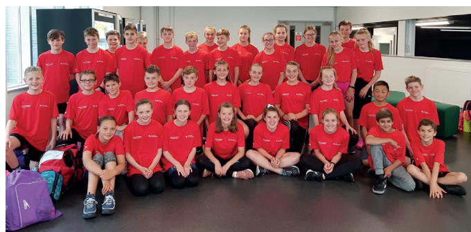
Above Regional Pathway Programme swimmers