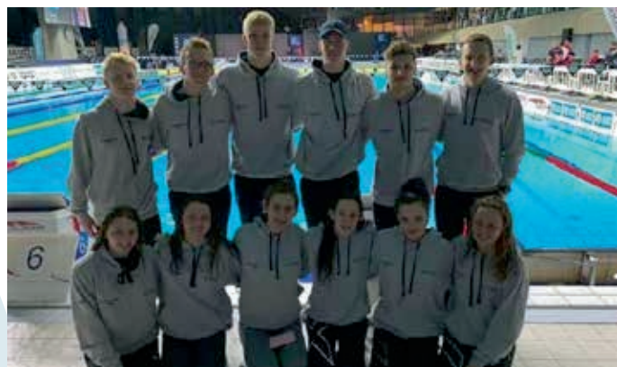
East Midlands Performance Team