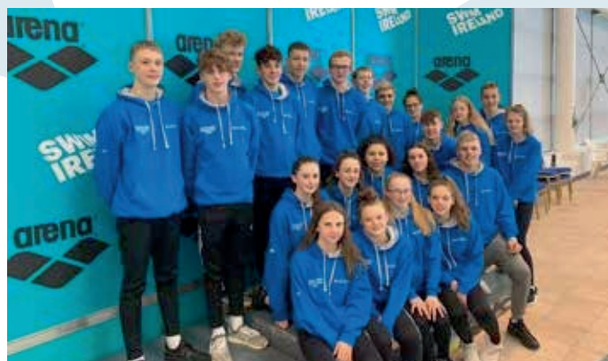
East Midlands Development Team