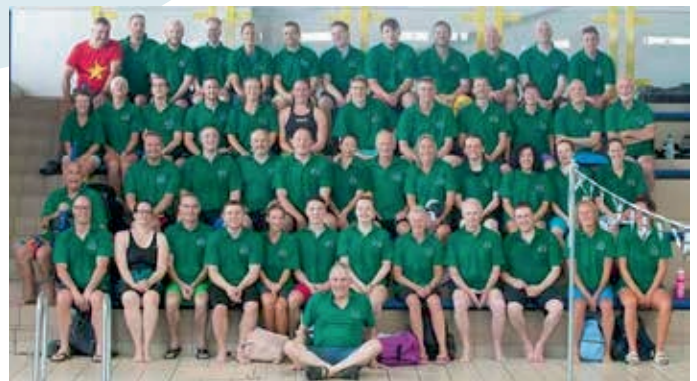
Nottingham Inter-County Team