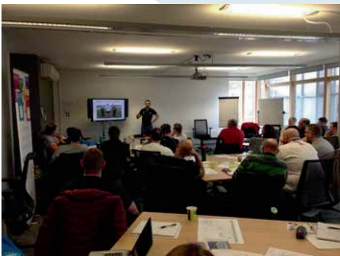
Coaching Generation Z Conference